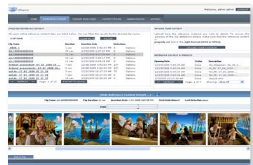
Figure 1: iPharro MediaSeeker™ Portal

The process is simple: Log in to our portal from any standard Internet browser and upload the content to be searched for. Within minutes, the system will begin monitoring all preselected television channels for instances of your content. Results are available in real time as charts, graphs, emails, or even RSS feeds. Other key features like difference detection and new commercial identification are also available.